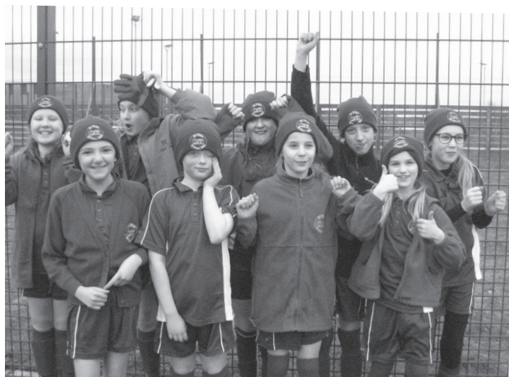
The girls' football team