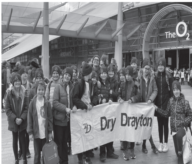
At the O 2 Arena